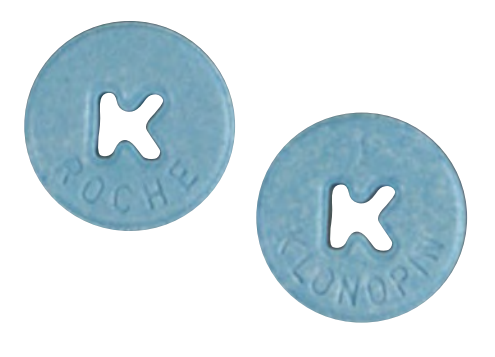
Klonopin 5 mg tablet

Most depressants are controlled substances that range from Schedule I to Schedule IV under the Controlled Substances Act, depending on their risk for abuse and whether they currently have an accepted medical use. Many of the depressants have FDA-approved medical uses. In the United States, Rohypnol® and Quaaludes® are not manufactured or legally marketed, and have no accepted medical use.